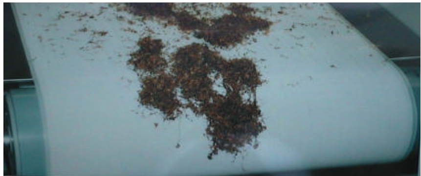
Use of Amseal™ in the Tobacco industry

For more detailed information about the market for Amseal™, please consult Product Management Synthetic Belting