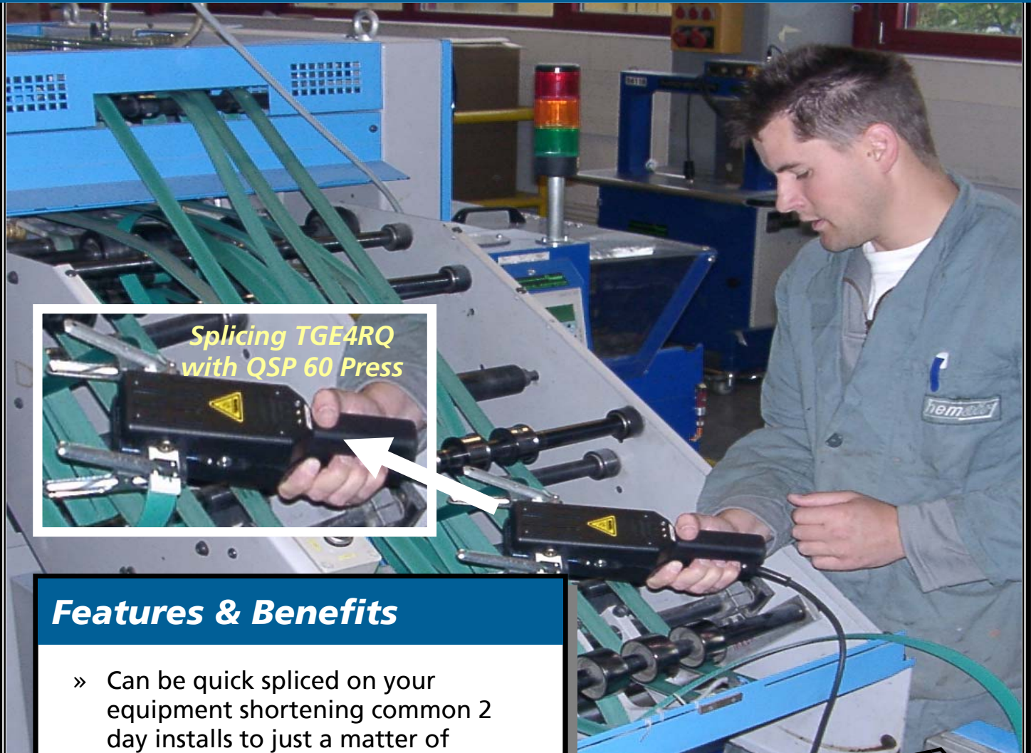
Splicing TGE4RQ with QSP 60 Press

Quick Splice Belting For the Newspaper, Publishing House and Commercial Printing & Graphics Community